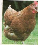
Shell-shocked: Harriet the hen