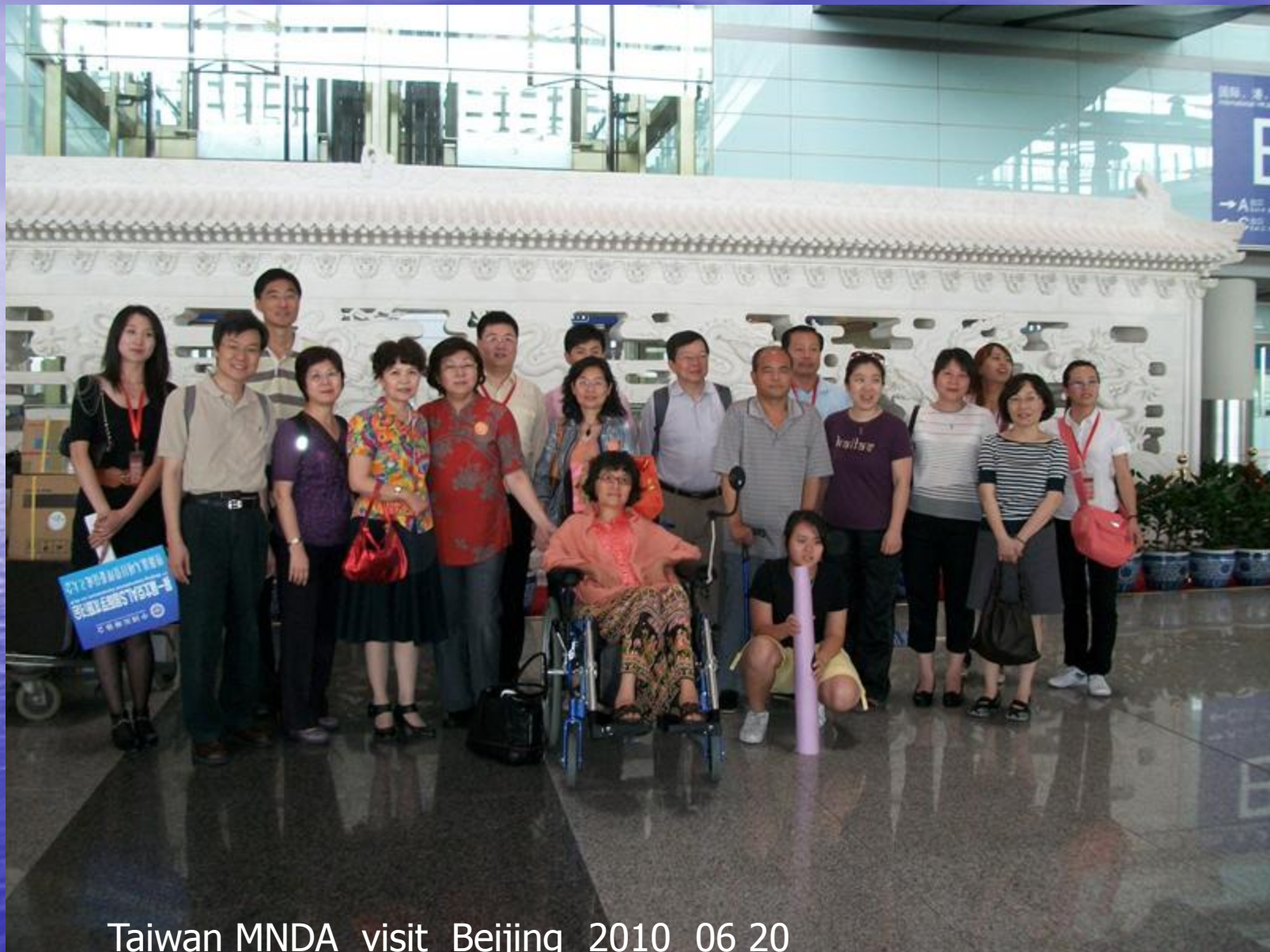
Taiwan MNDA visit Beijing 2010 06 20