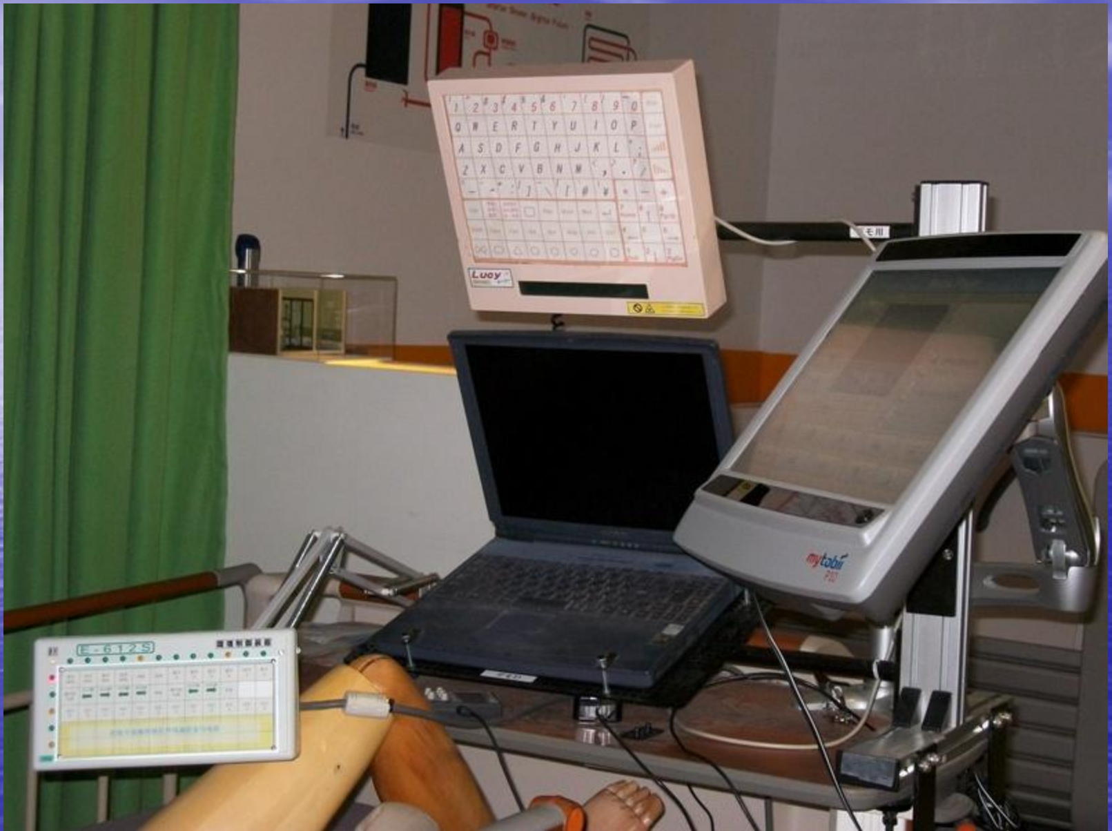
Computer aid communication for the disabled