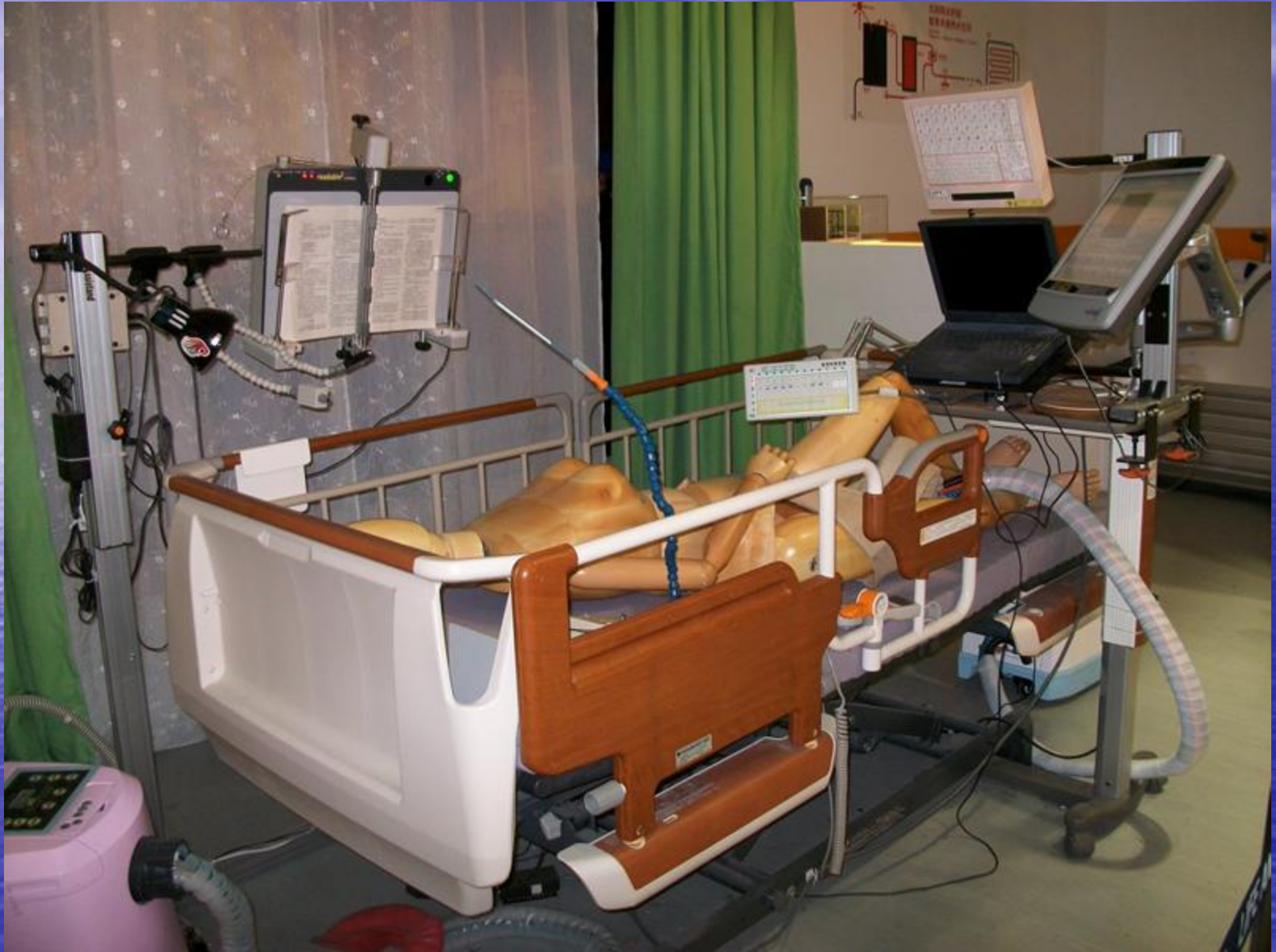
Exhibition in EXPO for the disabled patients