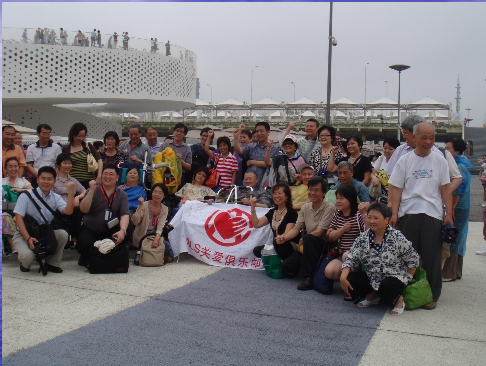
Patients from China, Taiwan visiting the Shanghai EXPO 2010