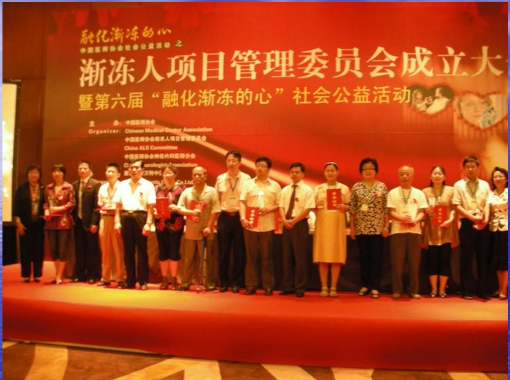
The first patient supporting club funded 2010 06 21 supervised by CMDA