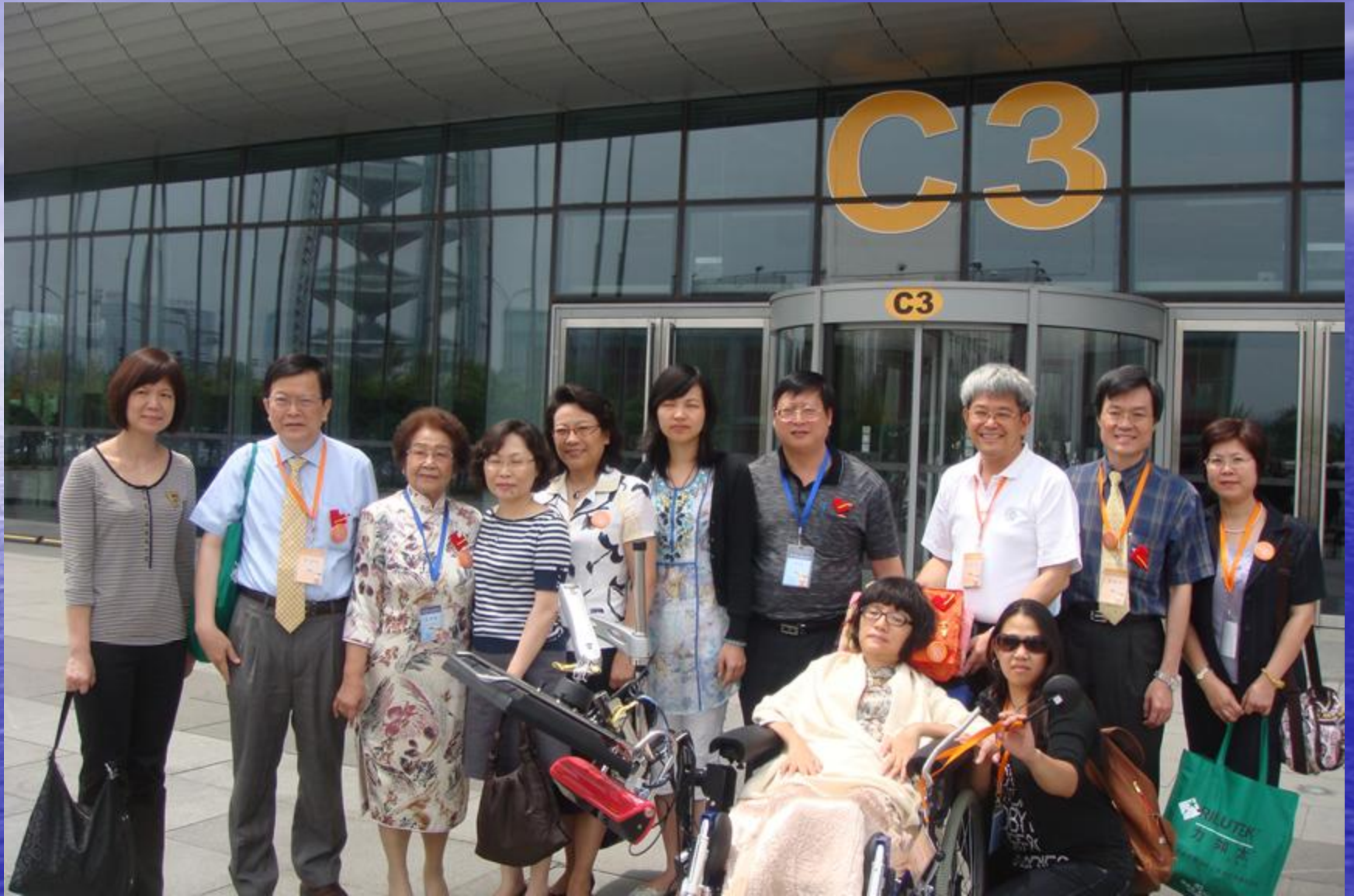
Ist Beijing Symposium on ALS 2010