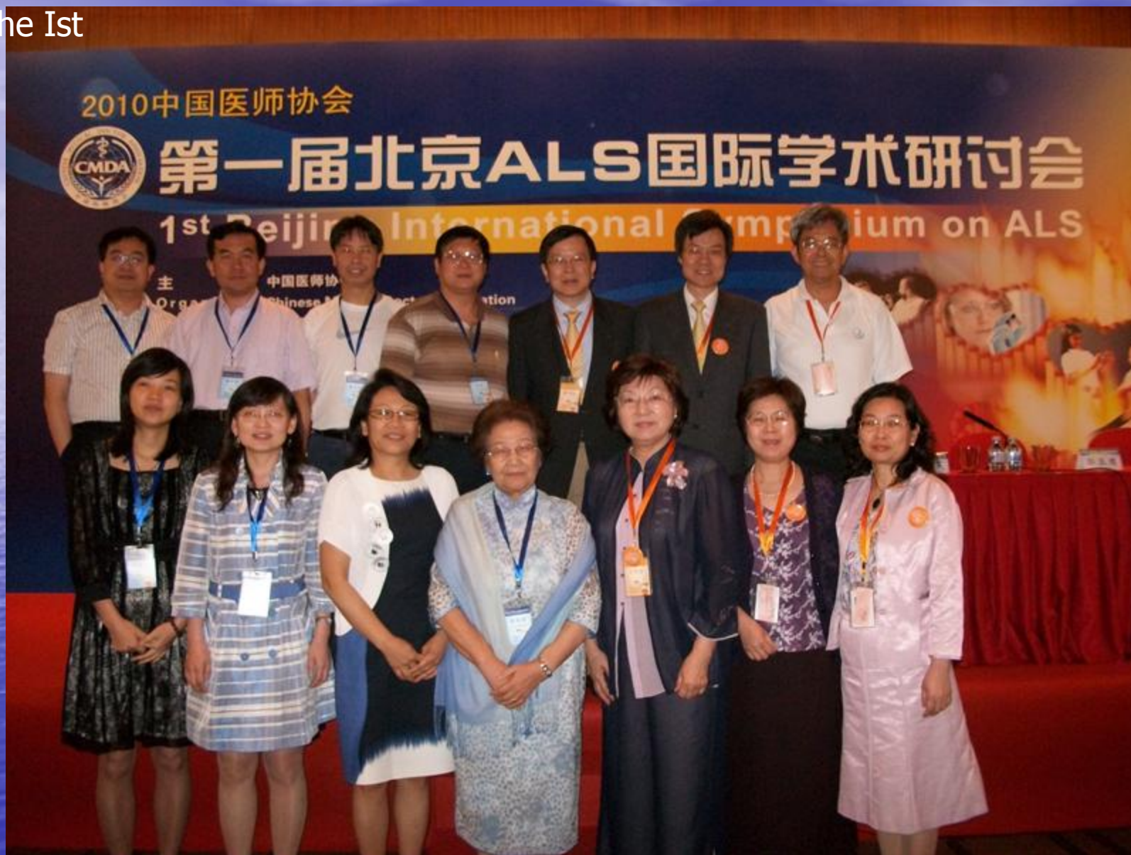
Speakers from Japan, China, Taiwan