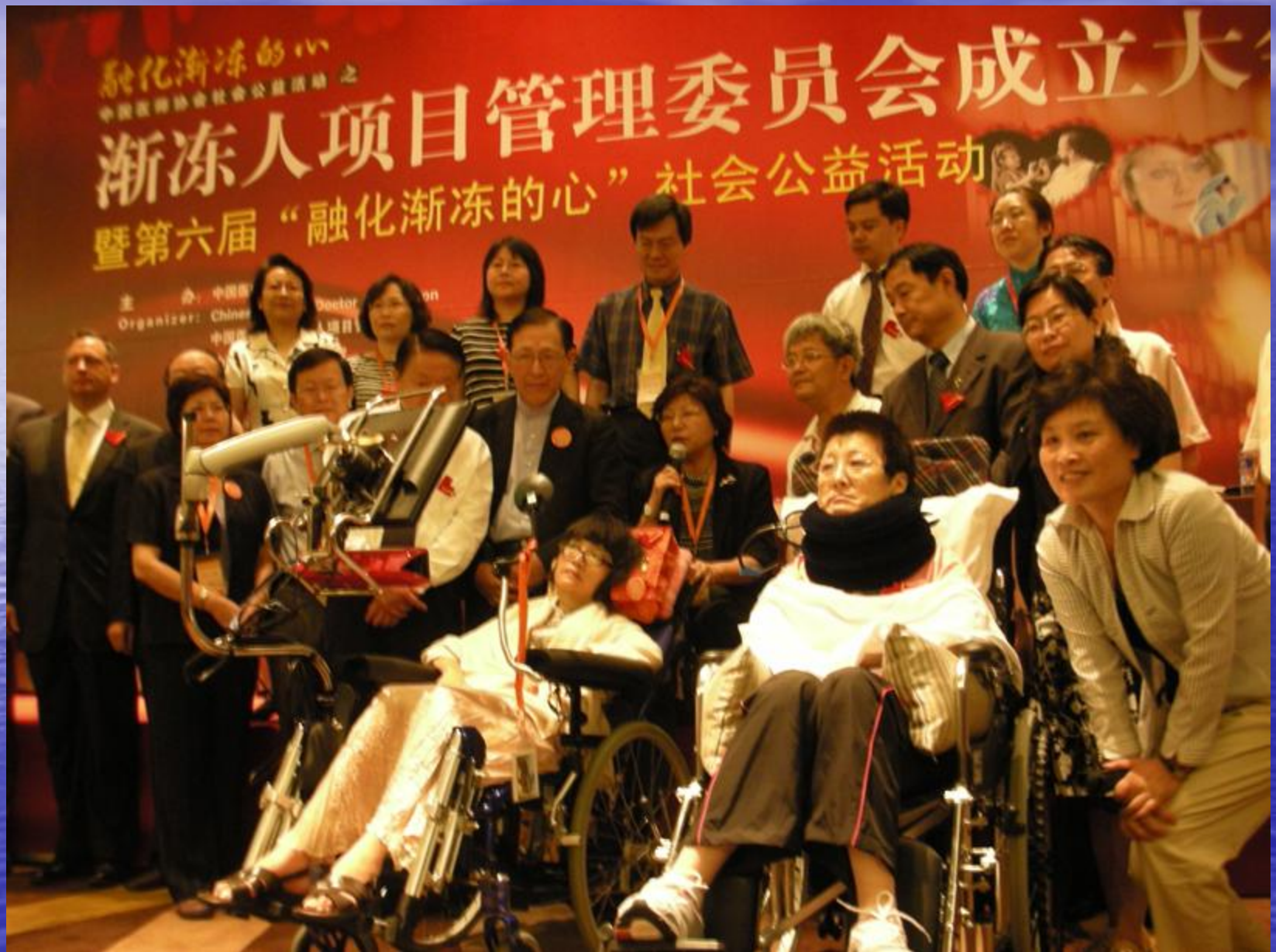
Patients from China, Taiwan sharing their care experience