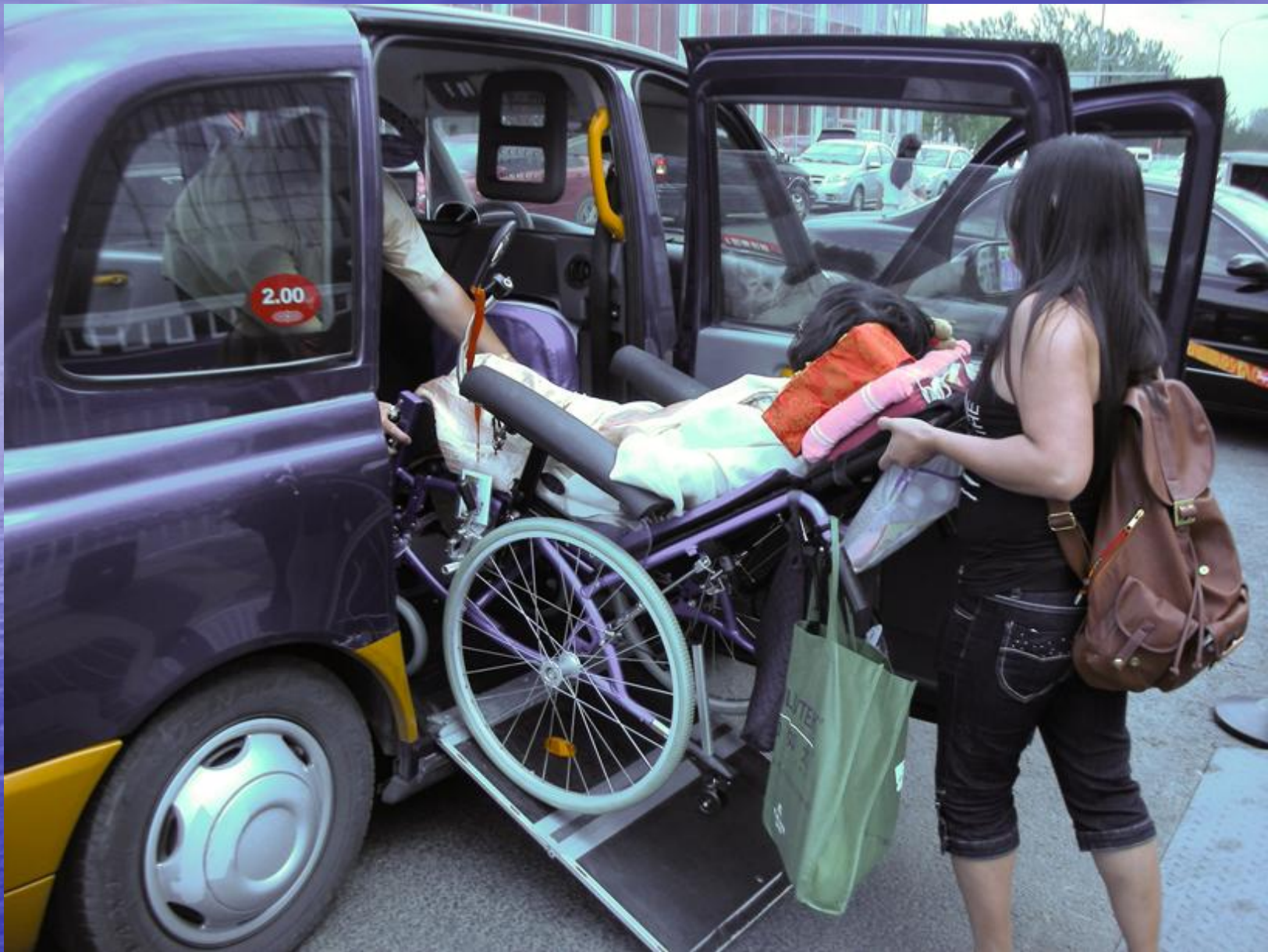
Car for disabled in Beijing