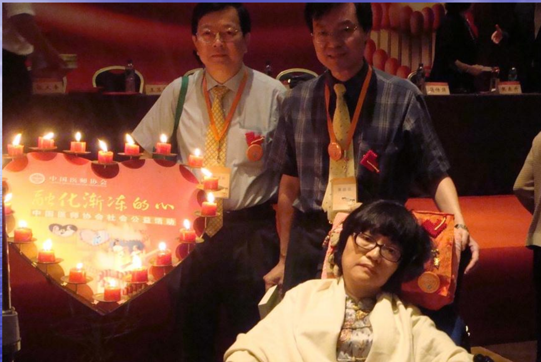
Merging the heart of all patients, family and care-giver