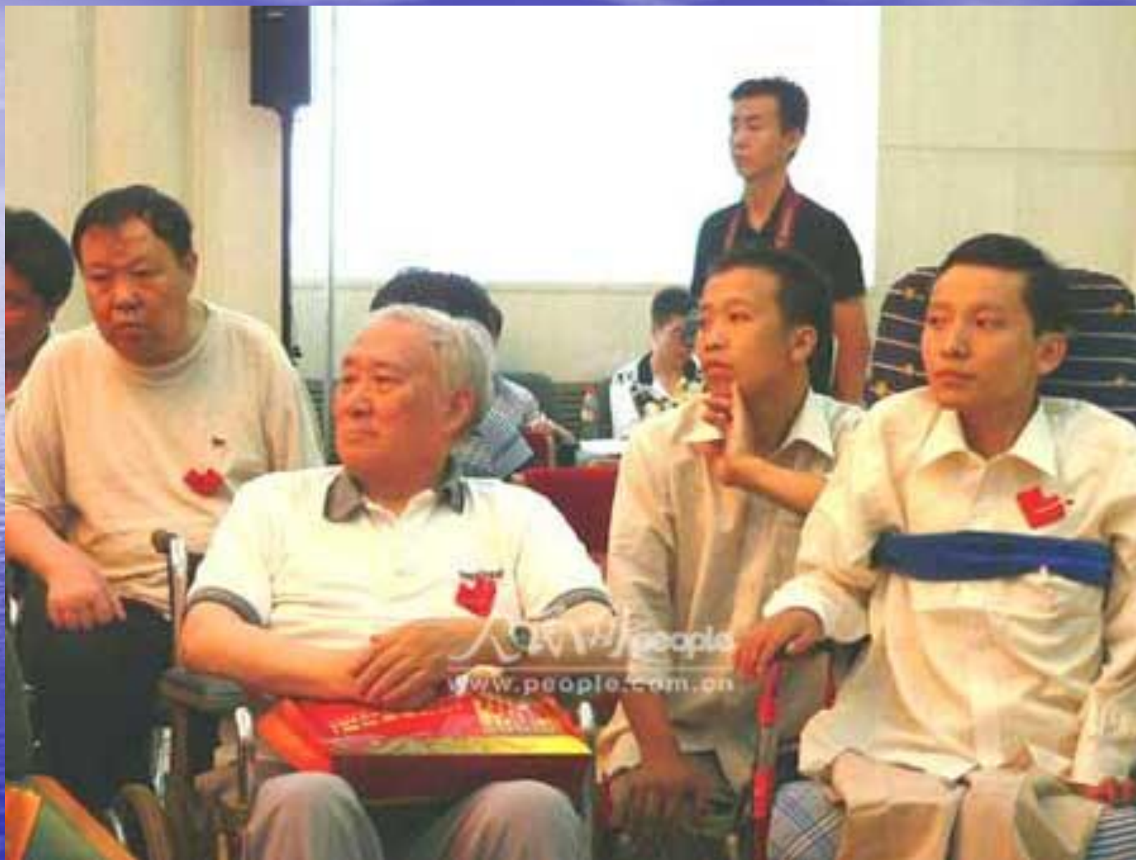
Patients and care giver from China